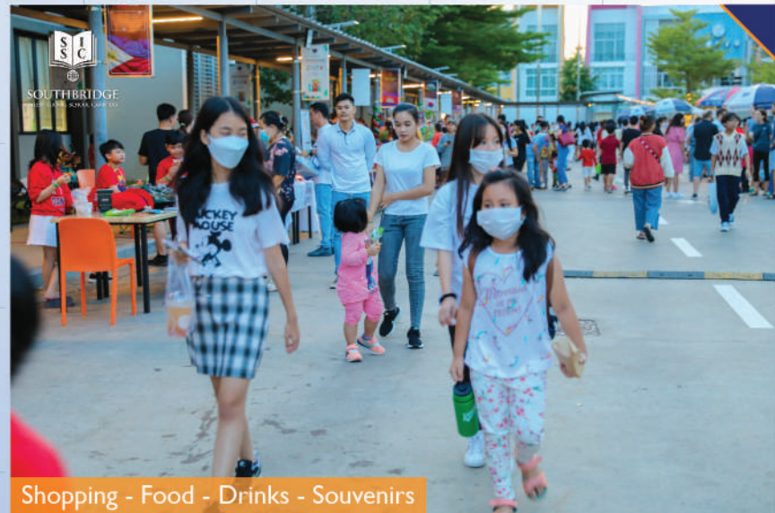
Shopping - Food - Drinks - Souvenirs

The students danced on the stage, performed a drama, and sang songs. Our favourite performances were the dancing to Christmas songs.